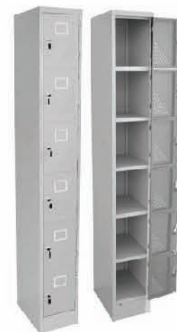
LL-01 6 Locker Cabinet