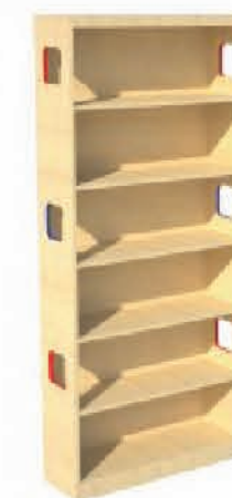
LF-04 Open Shelf Book Cabinet