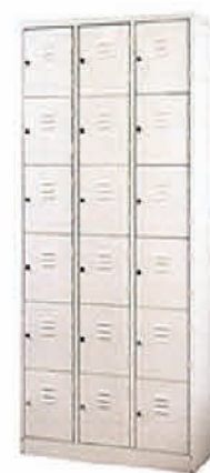
LL-03 18 Locker Cabinet