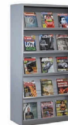
LF-08 Open Shelf Book Cabinet