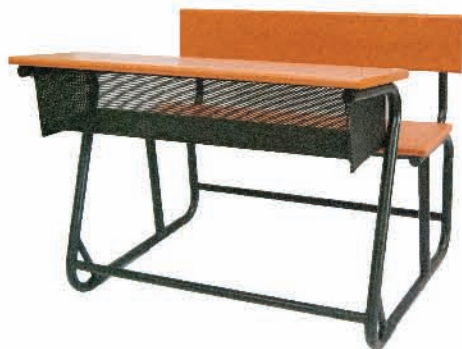
SB-01 3 Seater Bench