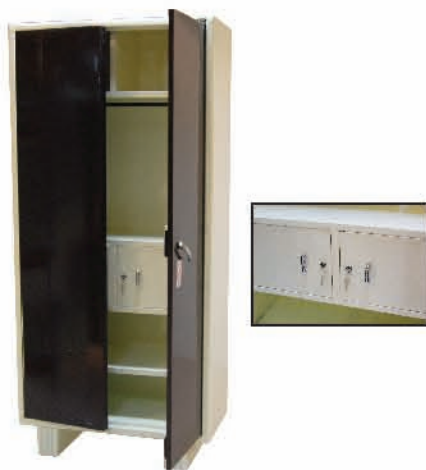
MS-02 2 Door Cabinet With Inner Locker