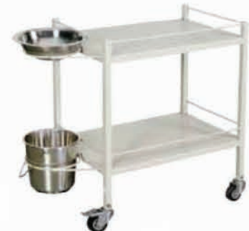
Product Model / M-15 DRESSING TROLLEY 17" X 27" X 30"