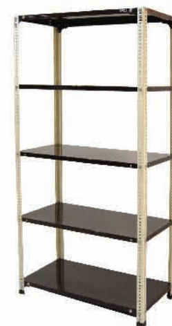
MS-05 Open Shelf Cabinet