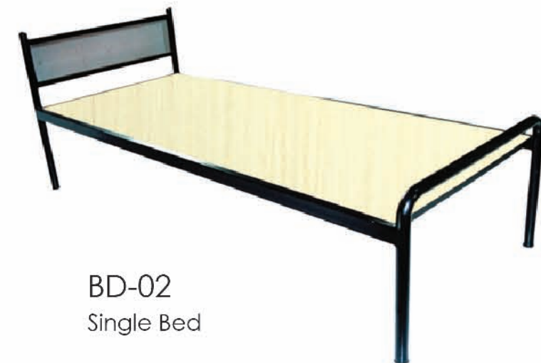
BD-02 Single Bed