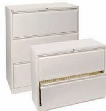
MS-04 Filing Locker 2/3 Drawer