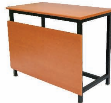
LT-05 Library Table