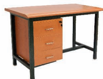
LT-07 Library Table Set