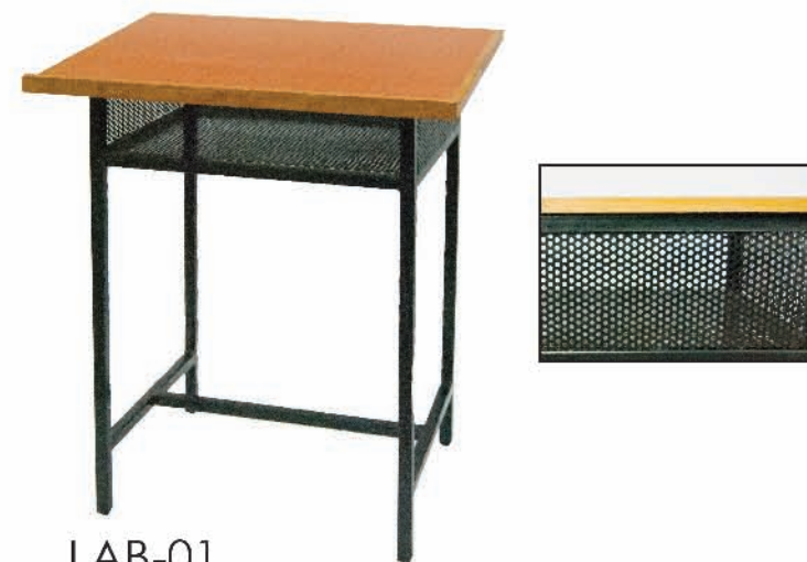
LAB-01 Drawing Table