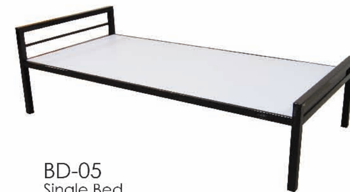
BD-05 Single Bed