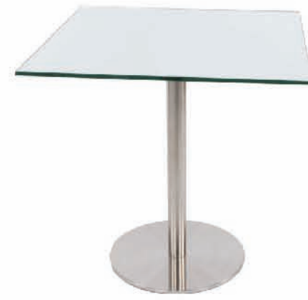
CT-03 Cafeteria Table