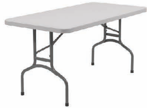
CT-01 Cafeteria Table