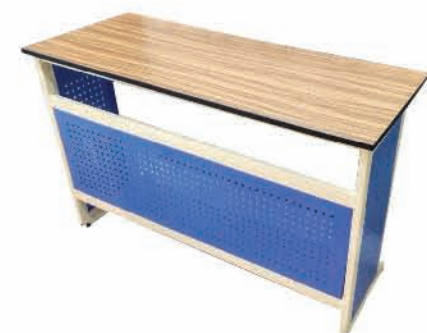
LT-04 Library Table Set