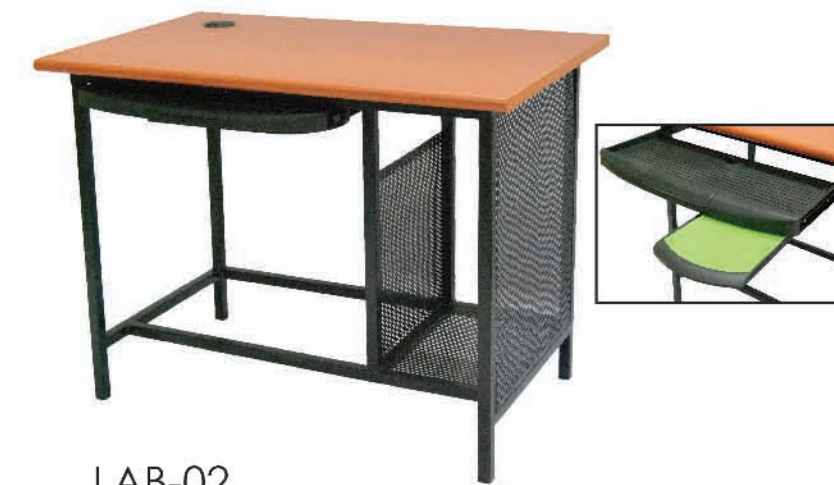
LAB-02 Computer Table