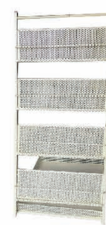
LF-06 Magazine rack