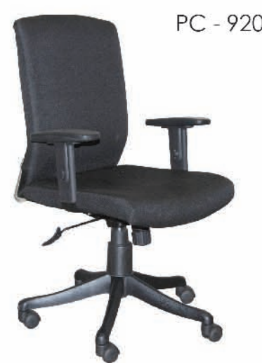
PC - 920