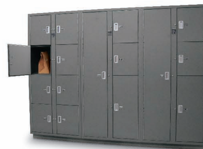
LL-04 16 Locker Cabinet