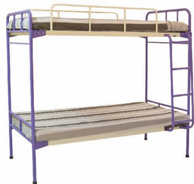
BD-03 Bunk Bed