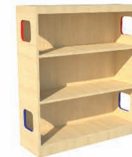
LF-05 Open Shelf Book Cabinet