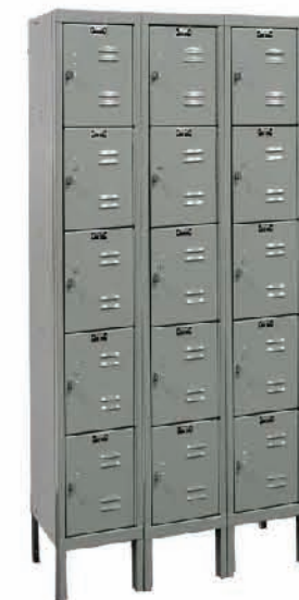
LL-02 15 Locker Cabinet