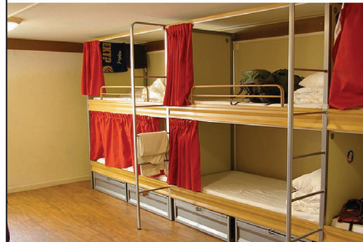
BD-07 Bunk Bed