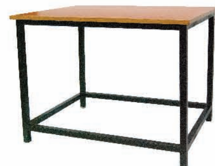
LT-06 Library Table