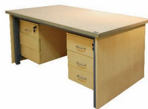
LT-09 Library Table Set