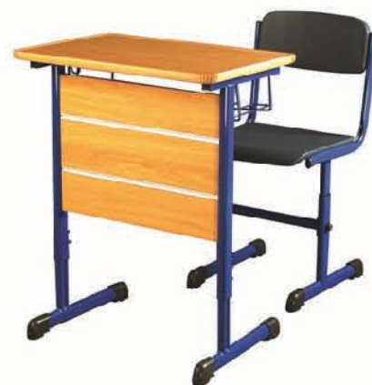
SB-04 1 Seater Bench