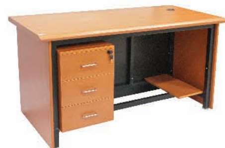
LT-08 Library Table Set