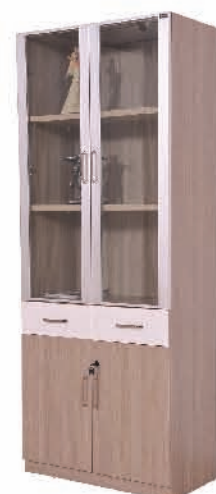
WS-02 2 Door Wardrobe