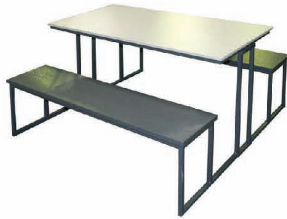
CT-02 Canteen Table Set