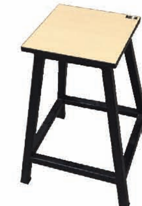
LAB-07 Laboratory Table