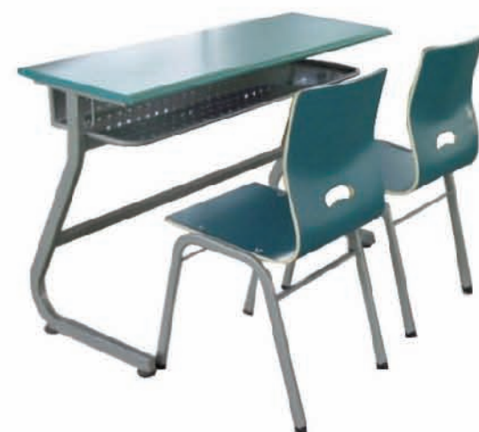
SB-07 2 Seater Bench