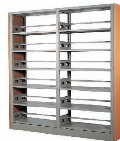
LF-03 Open Shelf Book Cabinet