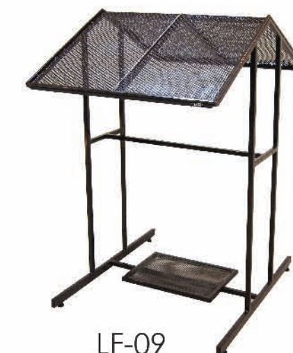
LF-09 News Paper Stand