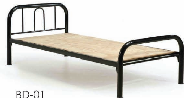
BD-01 Single Bed