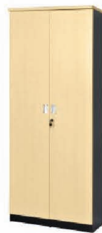
WS-01 2 Door Wardrobe