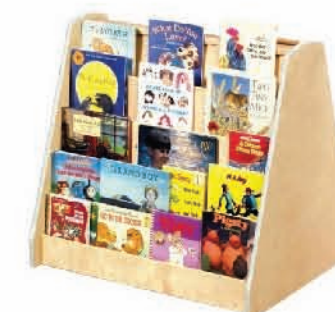
LF-07 Open Shelf Book Cabinet (Small)