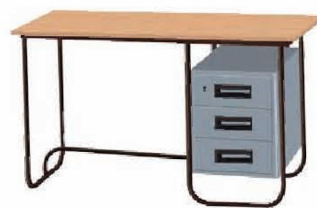
LT-02 Library Table Set