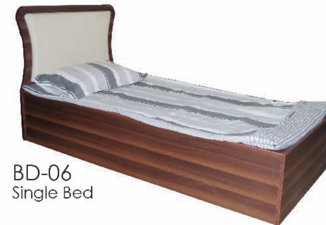
BD-06 Single Bed