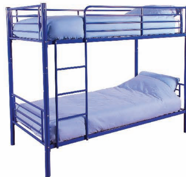
BD-04 Bunk Bed