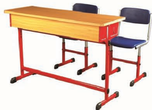
SB-03 2 Seater Bench