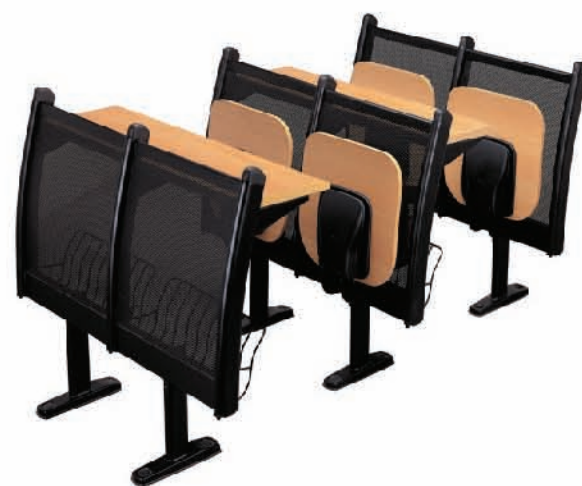
SB-06 2 Seater Bench