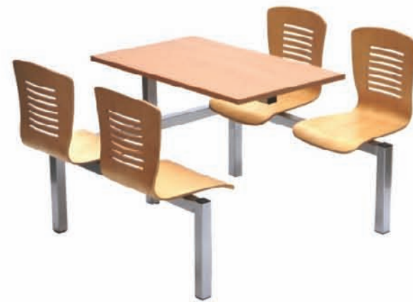
CT-06 Canteen Table Set