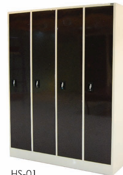
HS-01 Student Cupboard