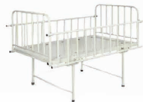
Product Model / M-00 PAEDIATRIC BED