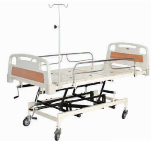
Product Model / M-7 I. C. U. BED