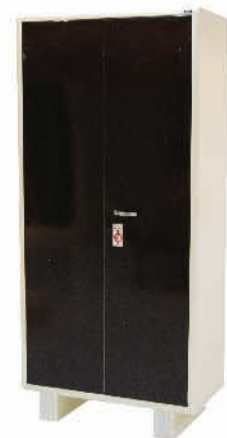
MS-01 2 Door Cabinet