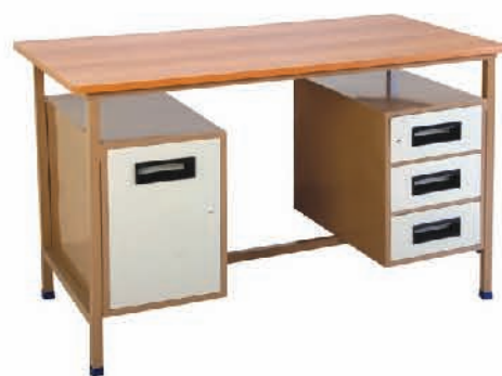
LT-03 Library Table Set