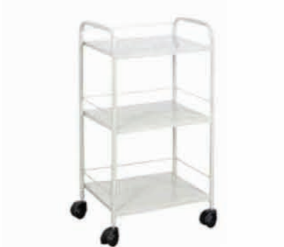
Product Model / M-13 BED SIDE TROLLEY