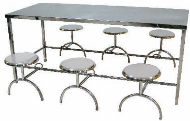
CT-04 Canteen Table Set