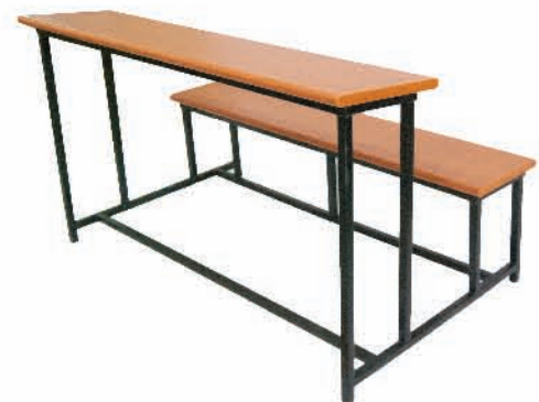
SB-02 3 Seater Bench