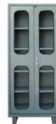
LF-02 2 Door Glass Cabinet