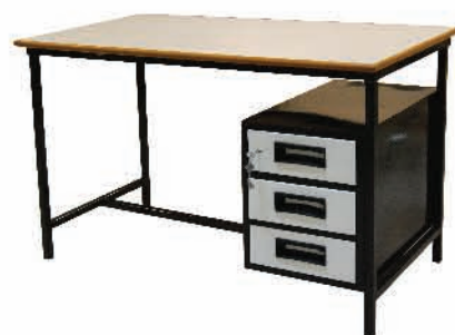
LT-01 Library Table Set