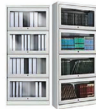
LF-01 2 Door Cabinet