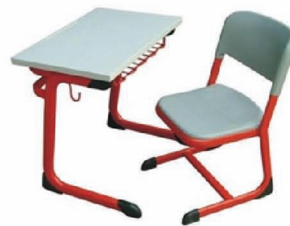
SB-08 1 Seater Bench