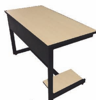
LT-10 Computer Table Set