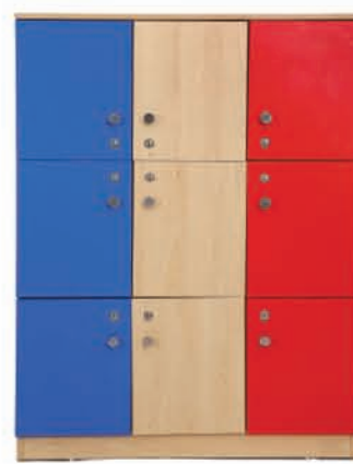
WS-03 Wooden Storage Cabinet