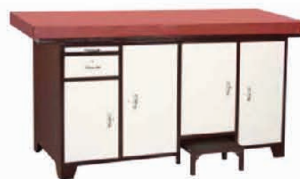
Product Model / ML-36 EXAMINATION COUCH 72" X 24" X 33"