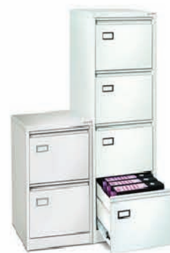
MS-03 Filing Locker 2/3 Drawer