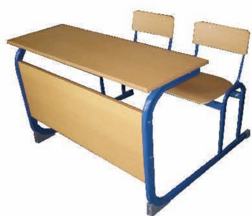
SB-05 2 Seater Bench