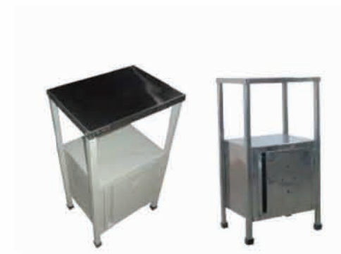
Product Model / M-12 30" X 12" X 14"