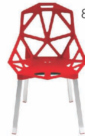
8058 - A