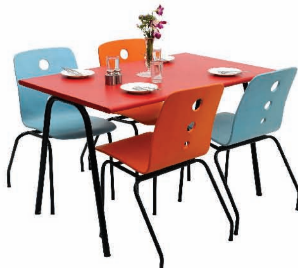
CT-05 Cafeteria Table Set